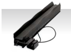
Optional wireless bottom safety edge