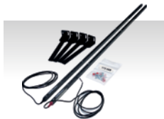
UL325 approved light curtain