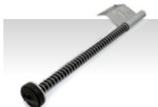
Pusher springs (required for standard lift track)