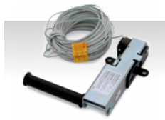
Cable tension monitor