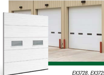
EX3728, EX3729, EX3724, EX3722, EX3723, EX3721, EX3720, EX3717, EX3718, EX3708, EX3709, EX3715