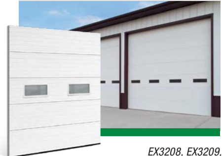
EX3208, EX3209, EX3200, EX3213, EX3211, EX3220, EX3158, EX3159, EX3150